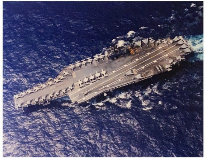
WABASH, and finally Captain of the aircraft carrier USS CONSTELLATION.

The highlights of his Navy career included four command tours. The first was Light Attack Squadron 192, followed by the Navy Flight Demonstration Squadron (Blue Angels), the fleet replenishment oiler USS