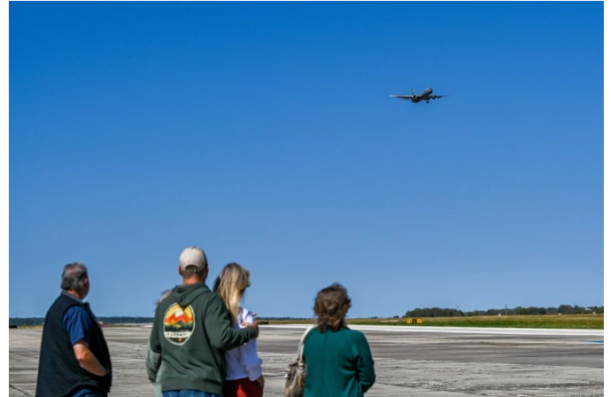
A KC-46 Pegasus aircraft from Altus Air Force Base, Oklahoma, executes a fly-over at the Wings and Warriors Fly-In at San Marcos, Texas, Nov. 9, 2024.